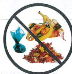
Food, Yard, and Pet Waste