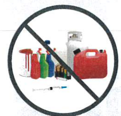
Medical and Household Hazardous Waste