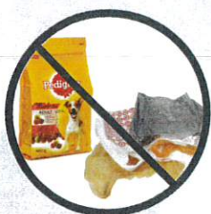
Plastic and Pet Food Bags