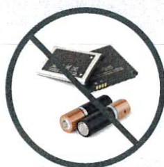
Batteries and Electronics